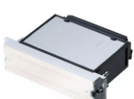
Ricoh Gen5 - Industrial High Speed Printhead