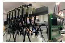
Individual Vacuum Areas