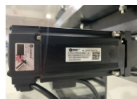
Panasonic AC Servo Motor