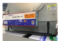
Anti Static System