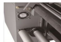
Pulling Media System