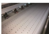
Full Aluminum Platform