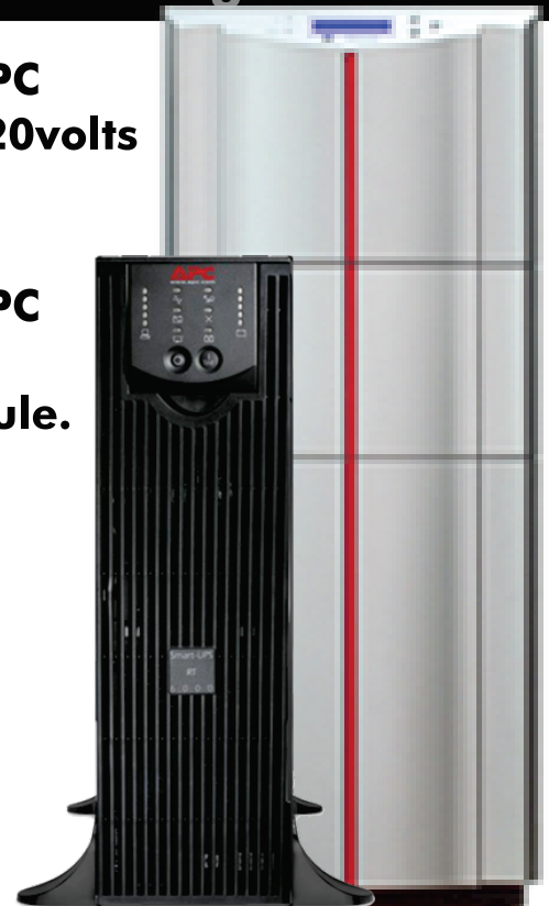
Pulsar 213S/222S same size. Pulsar 270 is larger

All systems include at least 30 minutes of runtime for basic print operations and easy-to-use power monitoring software.